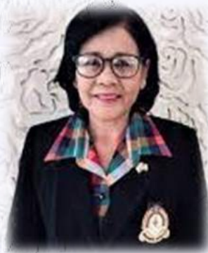
District Governor 3330 La-Or-Chinda