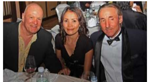
The party ended @ Holiday Inn & moved over to the Hard Rock Café