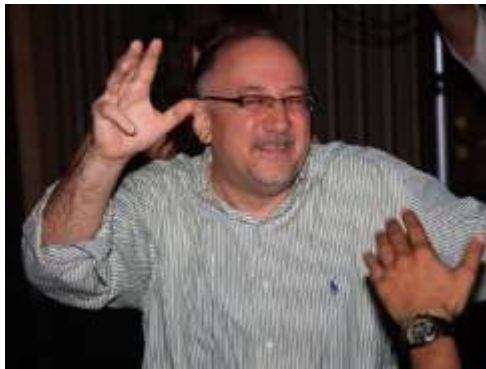
Movers & Shakers