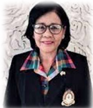
District Governor 3330 La-Or-Chinda