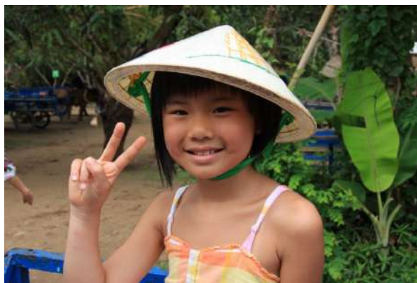
This young lady is not camera shy.