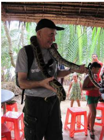
Getting up close & personal with some of the locals.