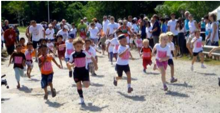
No special runners for these kids