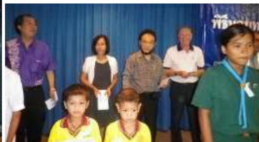
Child Watch Scholarship presentations

Perhaps one of the highlights of our community service projects was receiving the news that one of our previous scholarship students, a young Moken girl from the island of Koh Pratong, who had later graduated from a university, had returned to her home on the island to teach school and inspire other Moken children to complete their educations and go to college. To the best of our knowledge, she is the first Moken to graduate from college. We are convinced that the road to a better life for the Mokens along the Andaman coast is through educating their children and we strive to support this objective. Another highlight was receiving Paul Harris Fellowship Awards for nine of our club members in recognition of our club's participation in various joint projects with the Rotary Club of St. Moritz.